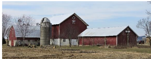
State Hwy 162 Town of Bangor