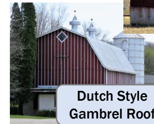
Dutch Style Gambrel Roof

Prepared by La Crosse County Historic Sites Preservation Commission www.lacrossecountyhistoricsites.org 608-785-9700