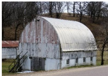
County Road DE - Town of Burns