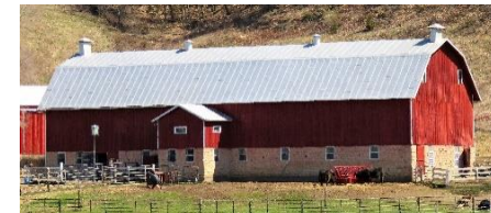
Bluffview Court Town of Holland