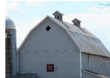
Big Creek Rd Town of Burns