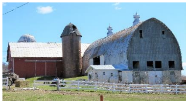
County Road M Town of Barre