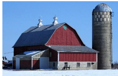
Hwy 33 and Schwartz Road Town of Greenfield

The eaves turn up at the end, thereby catching rain runoff and directing that water to either end of the roof.