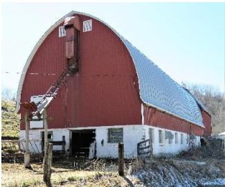
County Road JB Town of Bangor