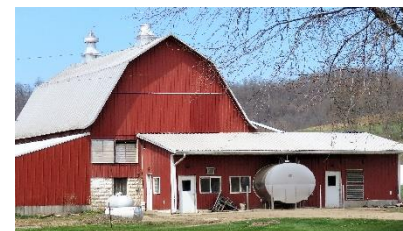
County Road D Town of Onalaska