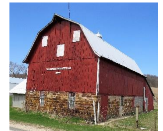
County Road D Town of Farmington