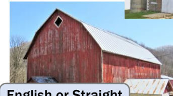
English or Straight Gambrel Roof