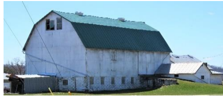
County Road B Town of Hamilton

The eaves go straight down, and the plane is straight.