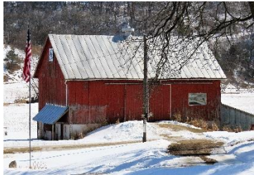
County Road M Town of Greenfield