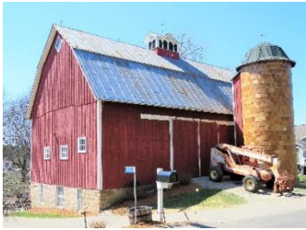
Ebner Coulee Road Town of Shelby