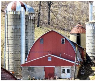
County Road G Town of Washington

This roof style became popular in the 1940s and uses trusses and laminated beams instead of traditional pegged-beam construction. It also provided the space necessary for maximum storage of hay which is important when feeding hungry cows.