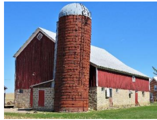
Swamp Road Town of Barre

This roof style is popular on barns and other farm buildings including the farmhouse. More traditional in its building design, this roof style has two planes that meet at the top and was thus easier to construct than the gambrel roof.